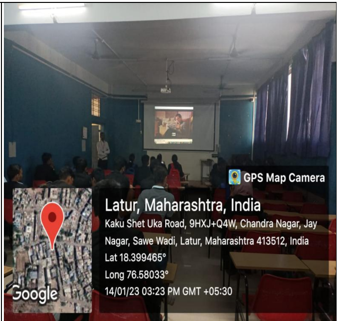
As a part of Film Fest this Movie is shown to student